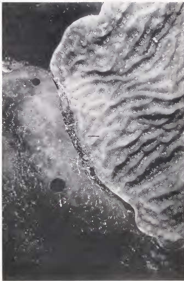
Figure 1. Natural associations of the sponge Plakortis halichondroides and the coral Agaricia lamarcki show a bleached area at the zone of contact. The necrotic area is evident in this photograph on the left side of the coral along the region adjacent to the sponge and above the 1.0 cm scale bar in the center. (Salt River Canyon, St. Croix, 25 m depth).

In this paper, we characterize the consequences of chemical-biological interactions in interspecific space competition between the coral Agaricia lamarcki (Milne Edwards & Haime, 1848) and the sponge Plakortis halichondroides (Wilson, 1902). Interactions between Pla-